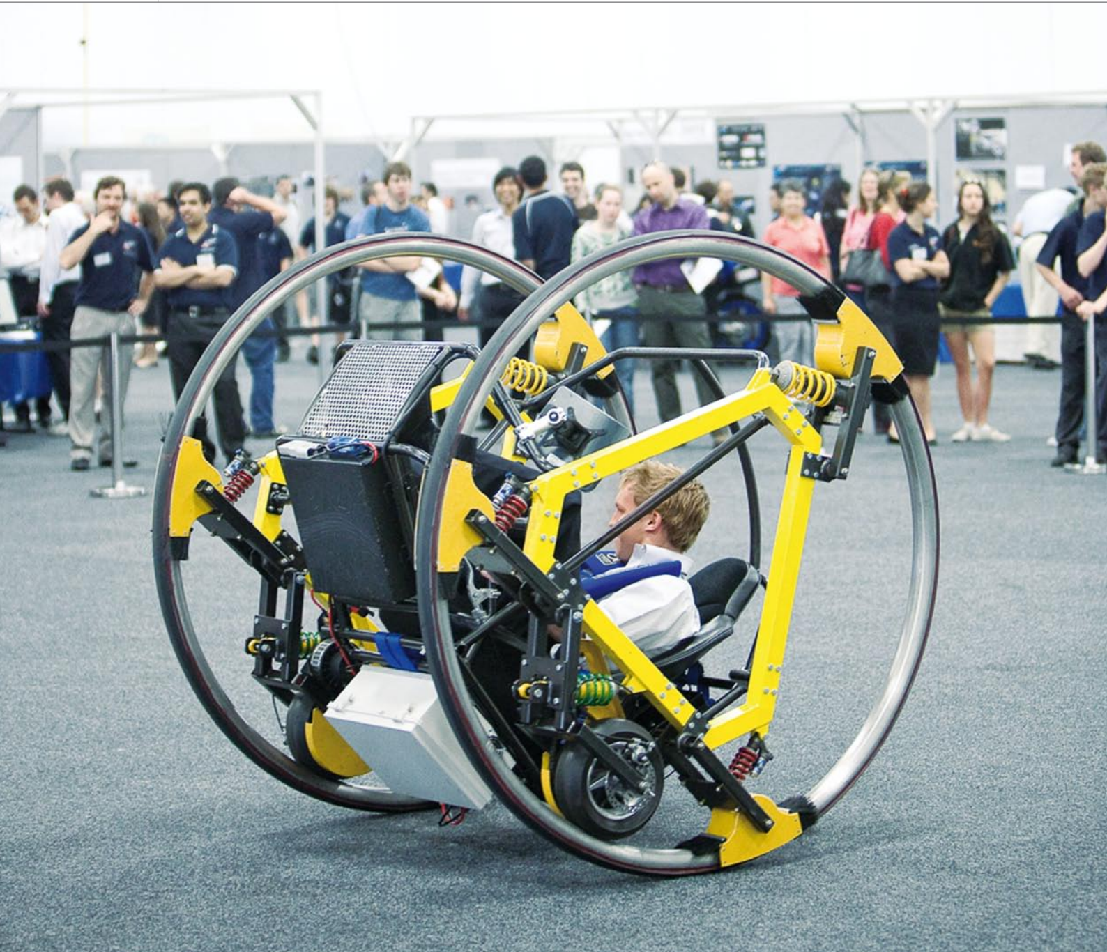
Figure 1: The Electric Diwheel With Active Rotation Damping (EDWARD) developed at the University of Adelaide.